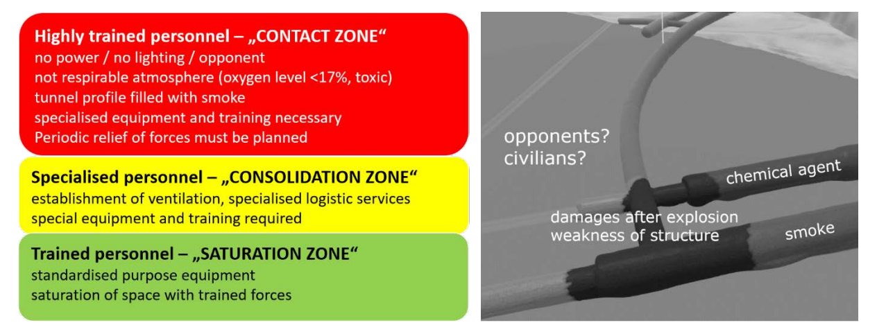
Figure 3: The operations concept is organised around three zones and takes a variety of challenges into consideration. (Hofer 2019a, p. 502)

Developing an operational concept was the most decisive prerequisite because it defines the necessary capabilities by using the term "complex", which refers to the scenario and not to the infrastructure. The procedures had to be tested with trainings and exercises because simplified notional layouts had proven inappropriate for the validation. This concept (Fig. 3) is organised around three overarching, functional zones requiring sound and comprehensive knowledge from several disciplines. Security forces in the red " Contact Zone " face the most adverse and difficult circumstances. Therefore, a periodic relief of these forces must be planned. With an increasing depth of penetration, the yellow " Consolidation Zone " must follow the red zone to enable the relief of forces and to ensure logistic support and communication. The green " Saturation Zone ", which connects the operation to the outer world and denies the opponent to access the rear area, completes the underground operational concept (Hofer 2019a, pp. 501–502). The concept breaks down complex situations with simultaneous threats of different kinds into interconnected areas with changing requirements and enables command and control elements to adapt to these circumstances and to reduce complexity.