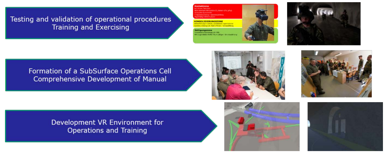
Figure 2: The lines of development frame the R&D approach within the NIKE project.

Driven by identified capability gaps and in the spirit of the S<sup>6</sup>-model, the research group NIKE initiated development activities and started to form and train units of the Austrian Armed Forces for subsurface operations. However, only a combination of civil and military competences made it possible to achieve the range of knowledge and skills needed to cope with the complexity of subterranean challenges. The NIKE research group, funded by the Austrian Ministry of Defence, serves as an umbrella organisation for several subprojects and it is an affiliate to the Montanuniversität (Mining University) of Leoben, Austria. This partnership provides the Armed Forces with specific knowledge (Hofer and Skupa 2018), thus enabling a quick build-up of expertise. By means of a team consisting of experts from various university chairs, specialists from Mine Rescue Service as well as from the Austrian Armed Force's engineer, CBRN<sup>4</sup> defence and infantry branches, together with geospatial specialists, in-depth knowledge can be provided in a comprehensive, experimental research and development hub. The NIKE I/2020 R&D campaign was based on three lines of development (figure 2).